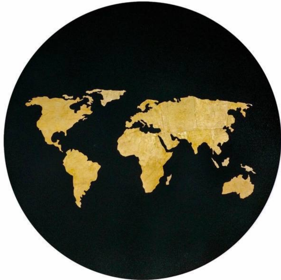
'Night Flight' Diameter: 100 cm From The Lost Planet Series by Natalia Kapchuk

Additionally, in creating my piece, Night Flight , I wanted to present the world map from an aerial perspective. Upon closer examination however, the viewer will notice many parts of the world's lands are missing. Most noticeably, my beloved UK, is a part of the missing sections. I do understand that this is an exaggerated and hyperbolic take, but with sea levels continually on the rise, a large portion of London could see rises in annual flood levels as early as the year 2030, according to new predictions.